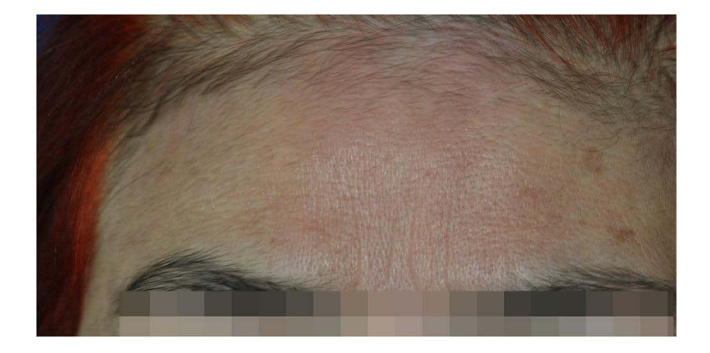
Figure 3 After 30 days after treatment, the white macular rash was completely re-pigmented.

she refused to add the dose of glucocorticoid to treat vitiligo. After obtaining the patient's written informed consent, the patient was given 10 mg/d oral tofacitinib, without the combination of phototherapy and topical medication. After 30 days, the white macular rash was completely re-pigmented (Figure 3), the pigment granules in the basal layer of the epidermis returned to normal on RCM (Figure 4), and no significant abnormalities were found on imaging and laboratory examination, including frontal and lateral chest radiographs, complete blood count, liver function tests, kidney function tests, plasma lipid levels, D-dimer, hepatitis B, and PPD test. No recurrence was observed at the 6-month follow-up, and the condition of SLE is stable.